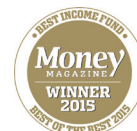
Bentham Global Income Fund