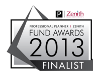
Global and Diversified Fixed Interest